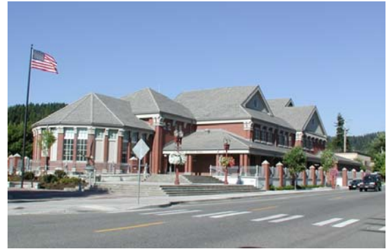
Issaquah Police Station and City Hall